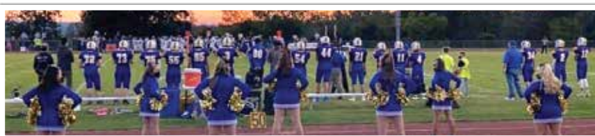
Friday Night Lights