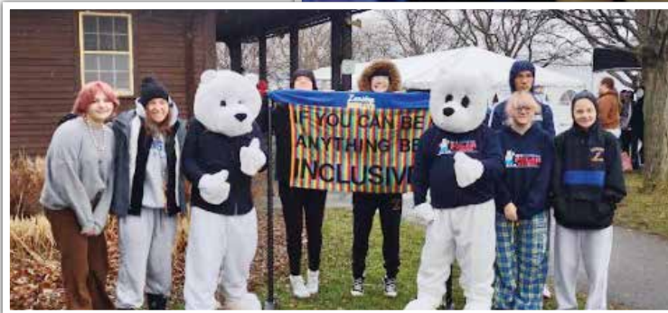
BOBCAT Team Polar Plunge