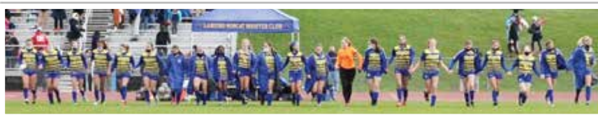
Girls Varsity Soccer